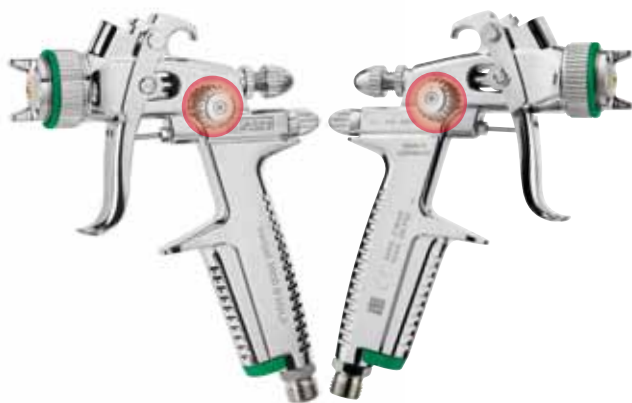
Round/Flat fan control to allow single-hand operation for both right and left handed painters.

With the SATA adam 2 mini, the gun inlet pressure can be precisely adjusted directly on the spray gun, in the same way as with any standard-size SATA spray gun.