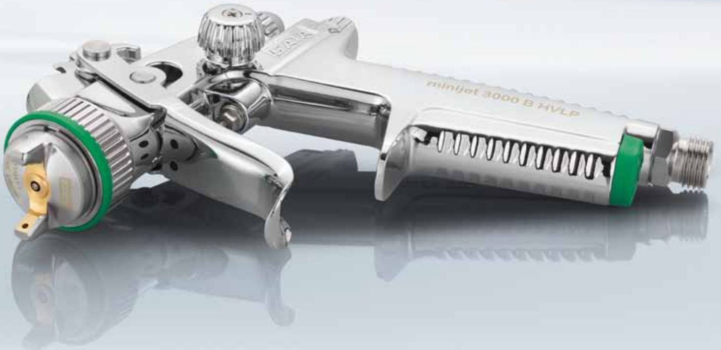
1.0 HVLP (at 29 psi)