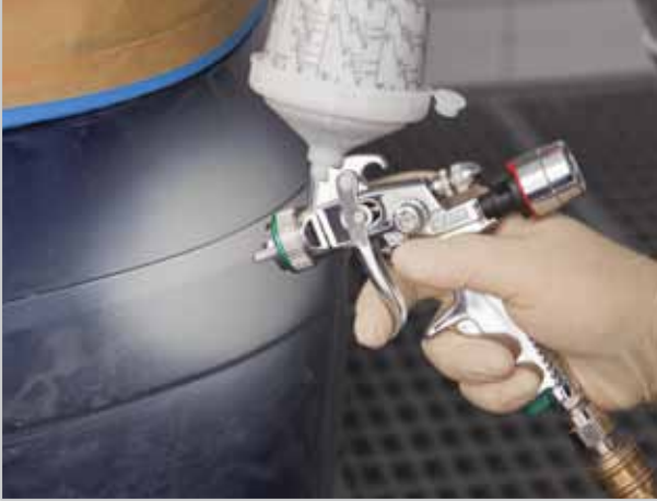
SATA RPS 0.3 l minijet – The disposable cup system fits directly on the SATAminijet spray gun – without cumbersome adapters.